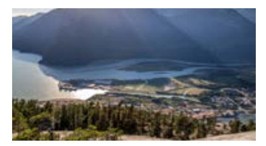
The District of Squamish, Squamish Nation, Carbon Engineering (leading developer of Direct Air Capture technology) and Newport Beach Developments have formed the Squamish Clean Technology Association (SCTA) to position Squamish as a world leader in climate change initiatives. In 2016, the UBC Clean Energy Research Centre signed a Statement of Cooperation outlining the possibility of expanding in Squamish.

Quests' location shapes who we are and how we learn. Nurtured by the ecosystem of the Pacific Northwest, and enriched by the cultural vibrance of Vancouver that provides global access via an international airport, Squamish is instrumental in our production of knowledge.